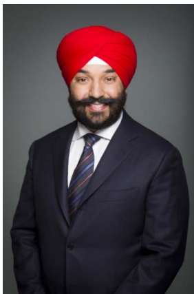
The Honourable Navdeep Bains Minister of Innovation, Science and Economic Development

It is my pleasure to present the 2018–19 Departmental Plan for the Canadian Space Agency.