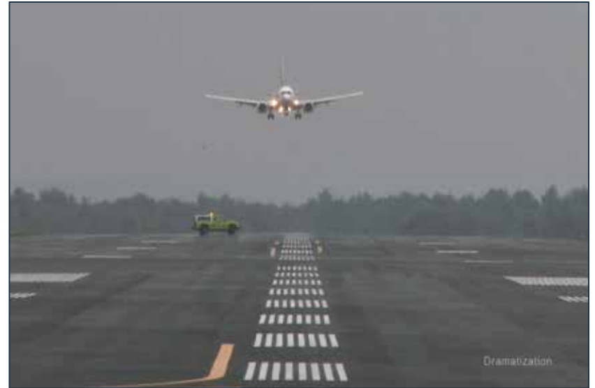
Risk of collisions on runways