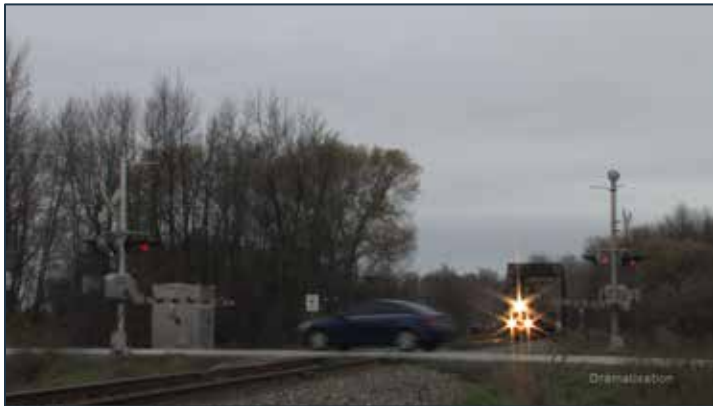
Railway crossing safety