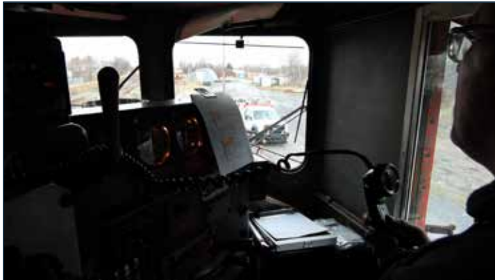
On-board video and voice recorders