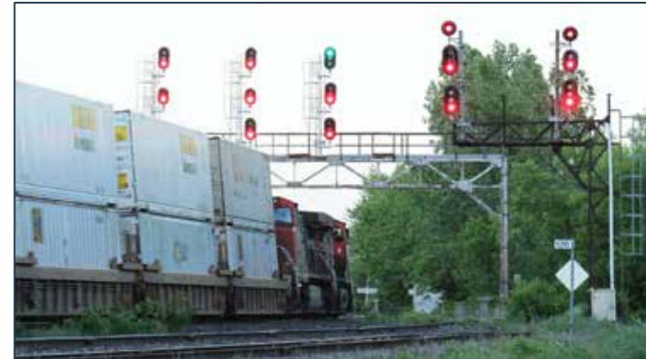
Following railway signal indications