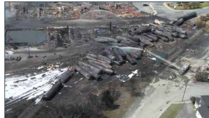
Transportation of flammable liquids by rail